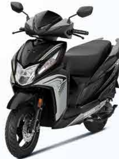
PEARL DEEP GROUND GRAY (STRIPE)