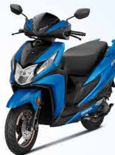
MAT MARVEL BLUE METALLIC