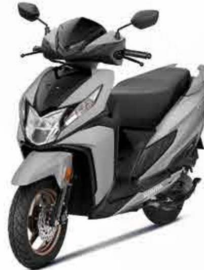
PEARL DEEP GROUND GRAY (EMBLEM)