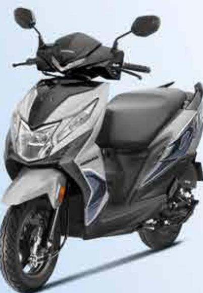
PEARL IGNEOUS BLACK + PEARL DEEP GROUND GRAY